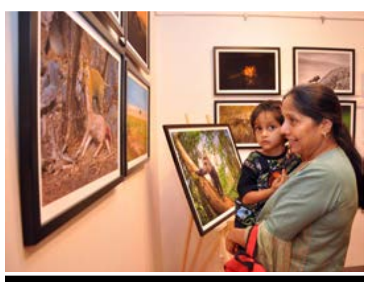
A regular visitor to the gallery observes photographs displayed by a group of photographers from DCP Expeditions in May 2019