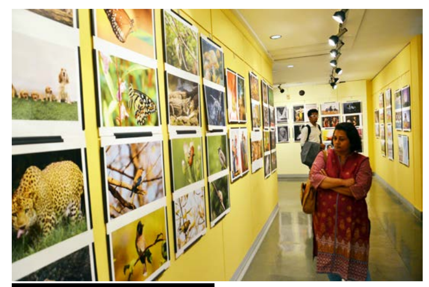
The June 2015 edition of the annual exhibition of the Symbiosis School of Photography, Pune, held at the gallery

Through these pages of ON Stage, let me take you on a visual tour of some of the finest exhibitions that have taken place between 2010 and 2020. In this difficult time when photojournalists are risking their lives to document the crisis, I dedicate this feature to them.