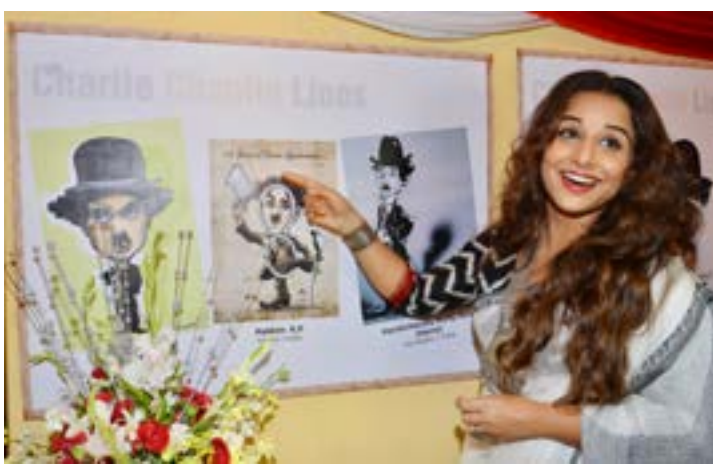
Nearly 100 cartoonists organised an exhibition on Charlie Chaplin in June 2015, which was inaugurated by actress Vidya Balan