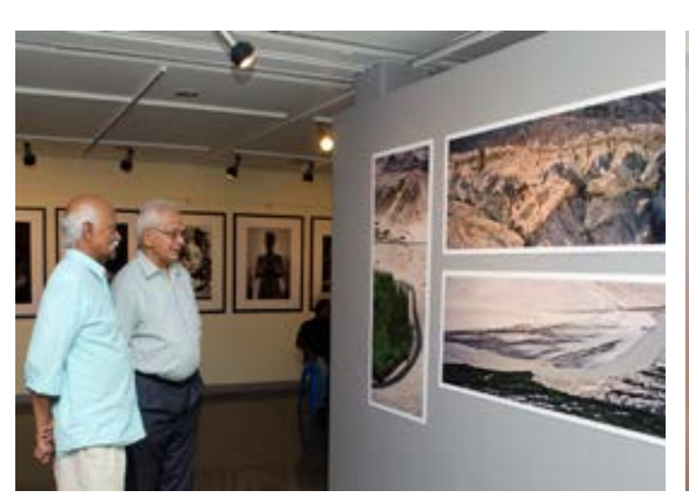
Asian Photography magazine's national photo exhibition inaugurated by noted wildlife photographer and businessman Kakubhai Kothari