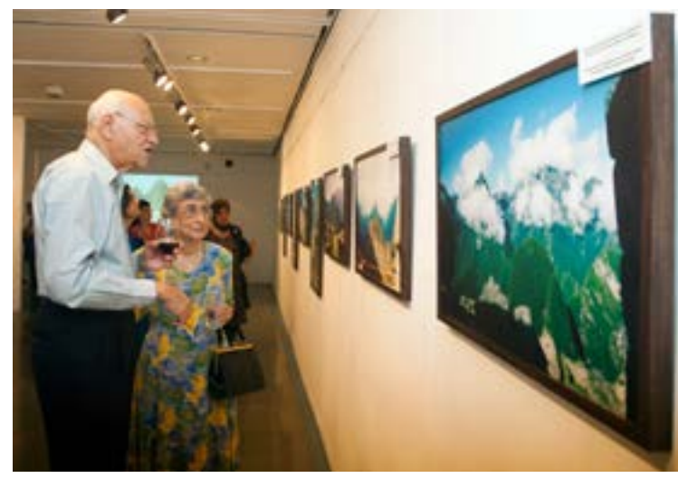
Julio Ribeiro, former Commissioner of Police of Mumbai, visits the gallery during the travel photo exhibition on Machu Picchu in November 2011