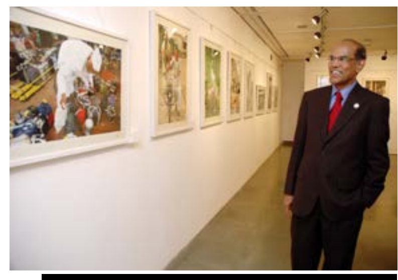
Noted photojournalist Dilip Banerjee's photo exhibition being viewed by the then RBI Governor D. Subbarao in May 2010