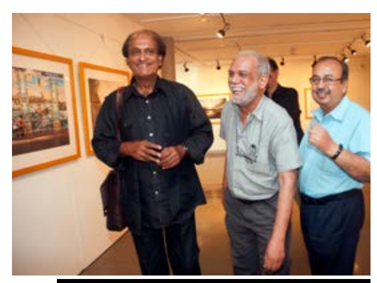
Legendary photographer Raghu Rai inaugurates Chandu Mhatre's exhibition titled Bombay in March 2013