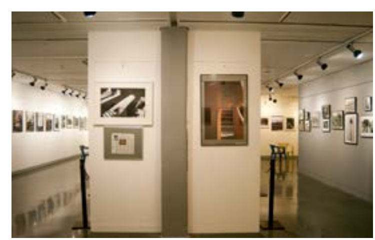
A wide shot of the Piramal Gallery during a photo exhibition by Richa Arora in February 2011